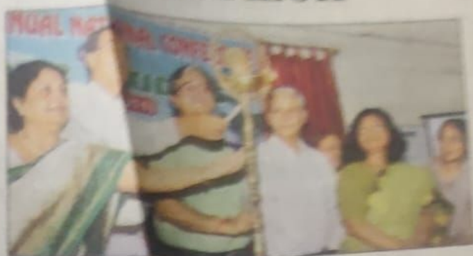
Annual conference on gender studies being inaugurated in Patna on Monday.