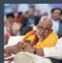
Chief Guest Prof. Sanjay Paswan, Member Bihar Legislative Council